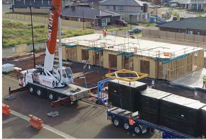
Better understanding of DfMA will result in faster, more economical modular construction to help meet housing needs.

"Through industry-led training and national collaboration, the Future of Housing Construction TAFE Centre of Excellence is leading the development of a modernised national construction workforce to build the homes Australians need. Through its innovative programs, it is supporting the construction industry to adopt modern methods of construction