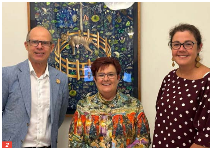
1/ Log wagons at a Russian railway station. Australia's $2 billion timber trade deficit is partly met by imports from high-risk countries, including conflict timber from Russia entering via China.