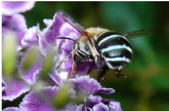
Nesting bees like the blue-banded bee, which burrow to make their nests, were found in the research to be better able to cope with climate change than their stem-dwelling cousins.

FWCA has long campaigned for sustainable Australian timber harvesting.