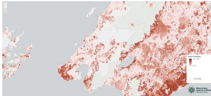
Ignition probability for the region near Upper Hutt on the North Island.