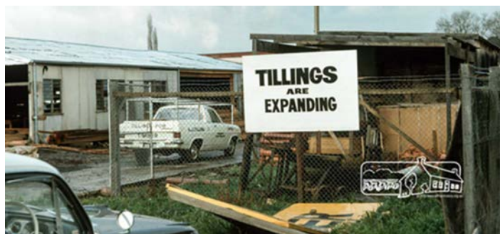
Tilling back in its early days at Eltham. The company – and its product range – has evolved enormously since then.

“The Tilling SmartFrame team will continue operating under the trusted Tilling name, retaining their staff and upholding the high standards that