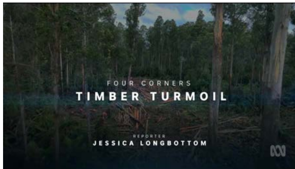
The opening credits for the 4 Corners episode.

Anger from the industry was palpable even before the program aired, with the adverts painting native timber harvesting in a negative light and allowing activist Green voices to frame the discussion. Sadly, for the majority of the actual report, that pattern was repeated. Rather than a dispassionate investigation of the costs, benefits and impacts of native timber forestry from environmental, economic or social positions, 4 Corners accepted the flawed premise that native timber harvesting is an environmentally