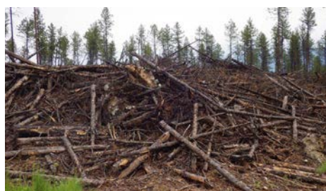
Wood waste currently left on forest floors could be a valuable fuel source.

technology. Biomass boilers already operate across New Zealand. More than 400 megawatts of biomass heat capacity are already installed. That is around 8% of total energy demand.