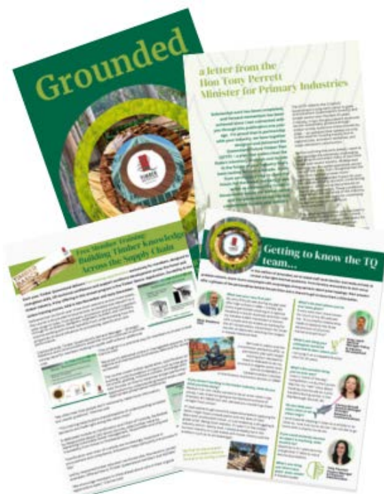
A snapshot of articles in this issue of Grounded .

The lows are acknowledged by Queensland Minister for Primary Industries, the Hon Tony Perrett MP. Widespread flooding has affected much of the State and he notes the impact of soaring fuel costs on industry operations, too. But the Minister also celebrates work done with TQ members to deliver the QFTP and outlines implementation measures such as work to deliver new timber sales permits from available state forests in 2027.