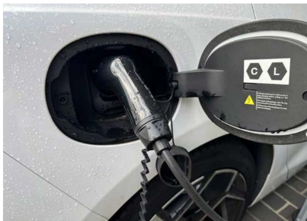
Shifting corporate and delivery fleets to EVs means you'll never have to worry about fuel availability again.

Kick-start funding is designed for businesses that are interested in piloting a few BEVs or for smaller fleets that want to start their electrification journey. Kick-start funding supports eligible organisations to transition to EVs by providing financial assistance for up to 15 BEVs and smart charging ports in