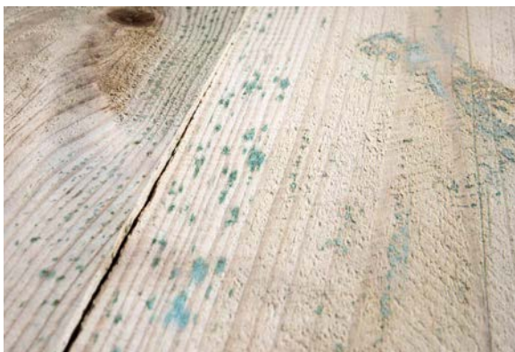
Mouldy timber boards represent an often overlooked risk to workers.

Less visible, but just as common, is contamination from animals. Open yard storage means timber packs can be exposed to bird droppings, rodents, and insects. Without good hygiene practices,