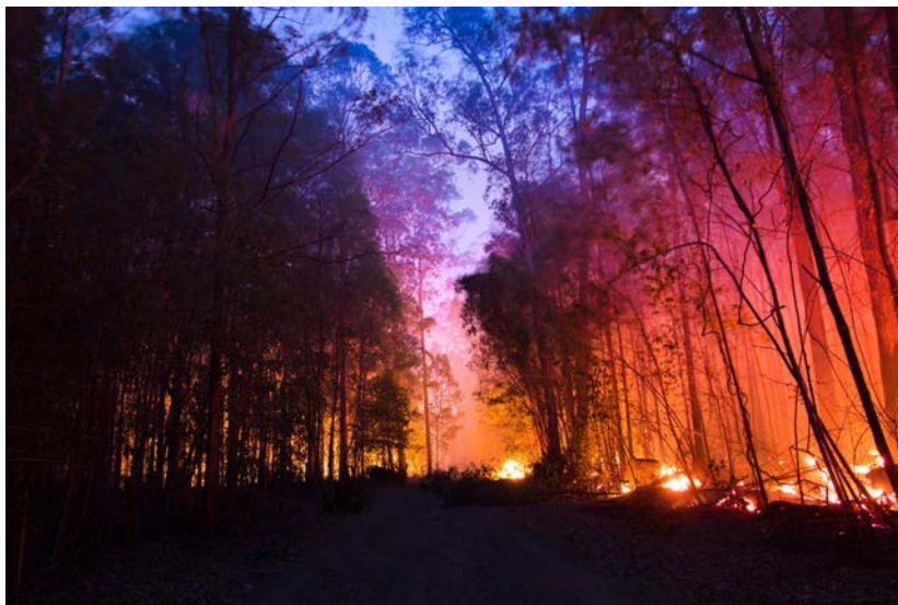
Regrowth forest does present risks, but media reports blaming forest harvesting misunderstand the research.

Understorey temperatures and fuel loads were measured pre- and post-fire at four permanent 'chronosequence plots', located in three burned mature sites and one burned regrowth site. Because the same site had been used for various ecological and biodiversity studies, including fuel and understorey temperature measurements conducted before and after the fire, there was a significant quantity of reliable data available.