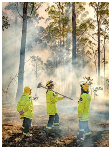
Because the cultural burn is 'cold', it's easily managed on the ground, with minuscule risk to trained personnel.

Ecological benefits of cultural burning include reducing heavy fuel loads, opening the forest understorey, promoting grass growth and encouraging the return of native plants and animals not seen on