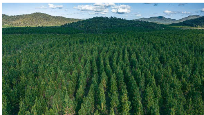
Australia is decades behind in growing the plantation timbers needed to build new houses.