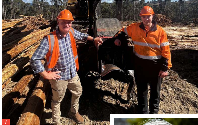
1/ Tasmanian Premier Jeremy Rockliff (here at Orana Enterprises) has a history of supporting sustainable timber harvesting.

“THE GREENS HAVE A COMMITMENT TO END NATIVE FORESTRY HARVESTING