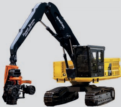
Komatsu PC300HD Attachment Carrier