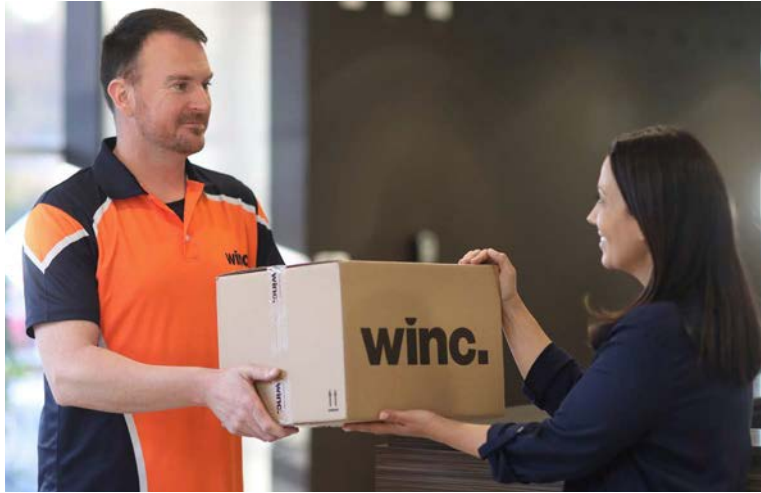
Winc and its business partners ensure office paper supplies are sourced responsibly.

Their dedication to social responsibility and driving positive change transcends the realm of workplace