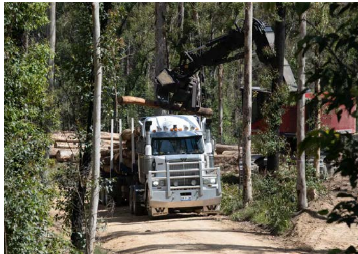
The new training program is designed to highlight areas of known risk for drivers and seek to lower or remove them.

The training package is open to all industries and professionals, both within and outside the transport sector. It combines the knowledge and expertise of the PFTM trainers with real-world examples and practical training sessions. With an emphasis on safety, efficiency, and industry-wide