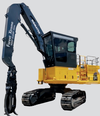
Komatsu PC300LL Log Loader