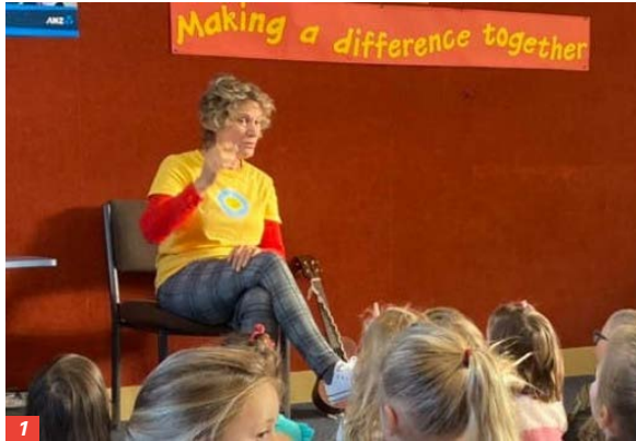
1/ The Dangerous Decibels program educates children on hearing loss and risk. It was awarded $5000 in the grants scheme. 2/ The Covenant Brothers Rugby 7s team received an $1800 grant.

In this round, Hearing Association Nelson Inc received a $5000 grant