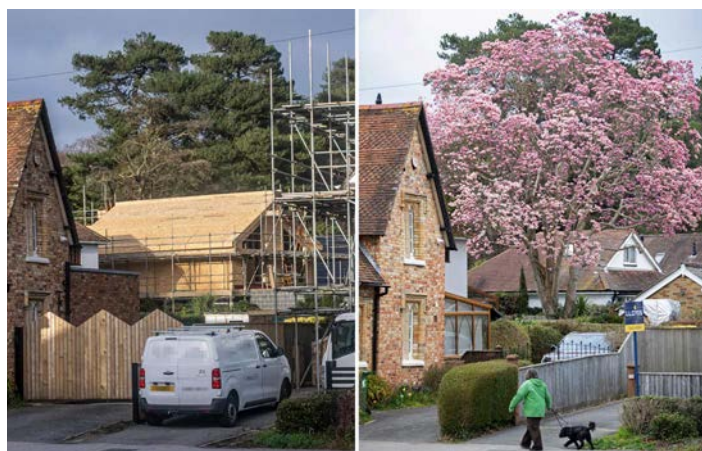
There is now a gap (left) where the magnolia once stood (right, image taken in 2021).

Sadly, after a recent inspection by a tree surgeon,