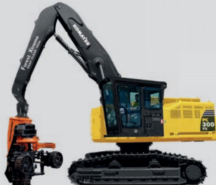
Komatsu PC300FX Attachment Carrier