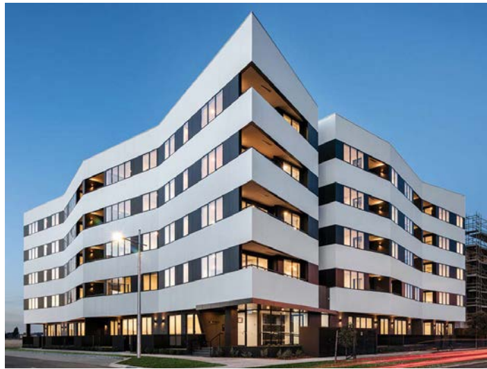
Lightweight timber mid-rise builds like the Oxford Apartments, just outside of Melbourne, promise a low-carbon model to help solve some of our most pressing housing issues.

The scarcity of affordable housing is a significant aspect of the housing crisis.