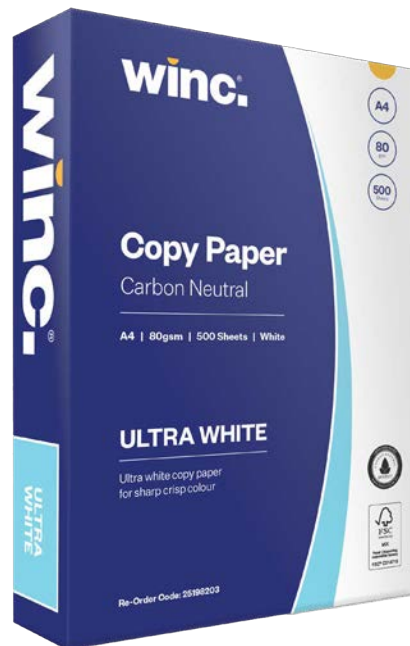
Winc copy paper is fully certified and carbon neutral.

A prime illustration of this commitment lies in Mandura, a Victorian workplace supplies