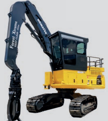
Komatsu PC270LL Log Loader