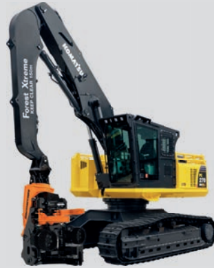
Komatsu PC270HW Attachment Carrier