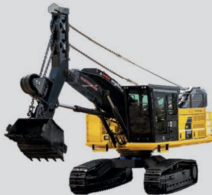
Komatsu PC300TL Tractionline