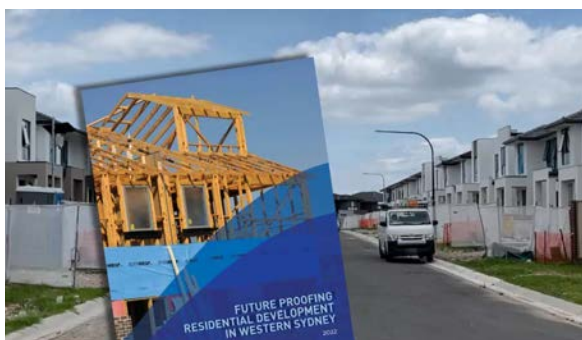
Western Sydney councils issued a report about future-proofing developments in Western Sydney.

The editorial, written by city planner Sam Austin, highlights a joint report led by WSROC – a coalition of councils in Western Sydney – that investigated the issue. Their key study tested a typical brand new single-storey house against a historic heatwave in 2017. It found that even with the air conditioner running, the daytime indoor temperature