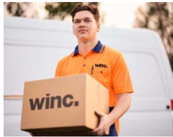
Winc partners with First Nations groups to provide training and career opportunities.

supplies. Winc firmly upholds the belief in the economic empowerment of First Nations Peoples as a pivotal force for fostering societal equality and progress. Through strategic endeavours such as partnering with MEGT to provide trainee placements for First Nations candidates and instituting a mentoring program geared towards career advancement, Winc actively fosters avenues for employment and education within First Nations communities.