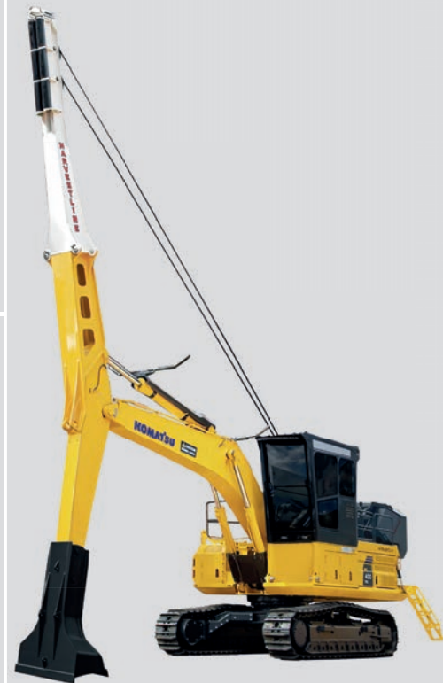
Komatsu PC400HL Harvestline

The Komatsu Xtreme models have been developed by collaboration between Komatsu Forest & Komatsu Osaka Factory to meet our tough forest conditions.